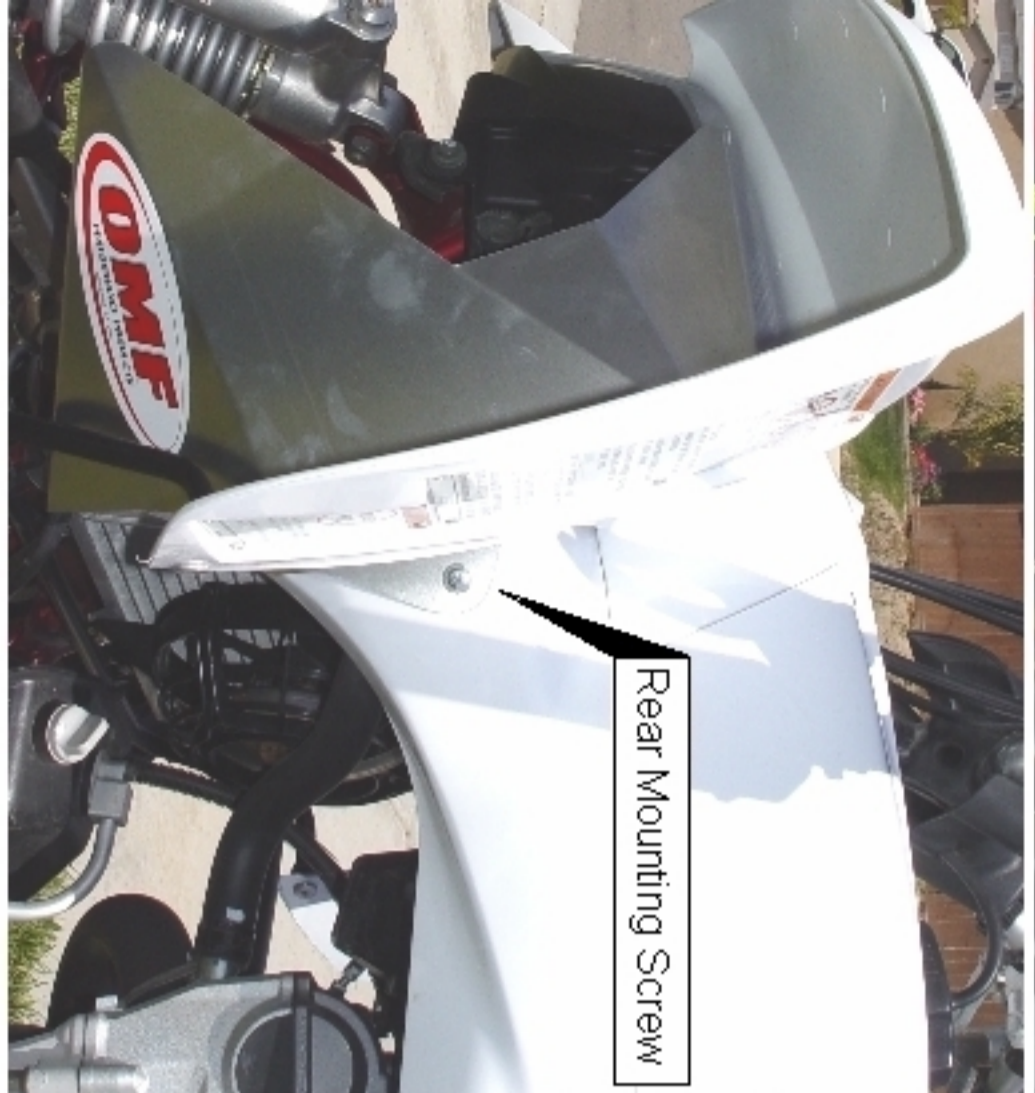
Rear Mounting Screw