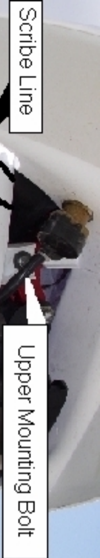
Upper Mounting Bolt